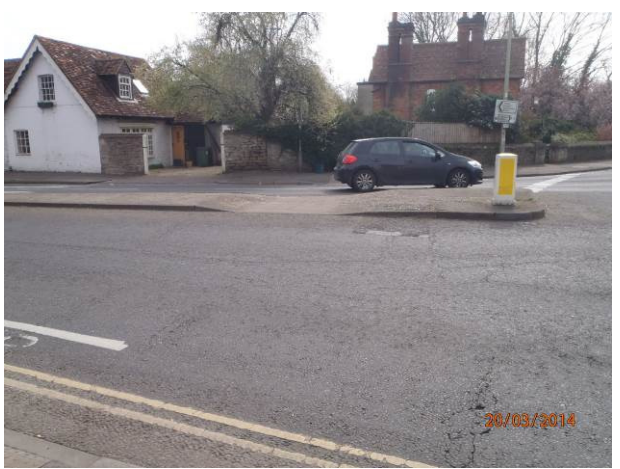
Photograph 2: Splitter island on Ock Street approach