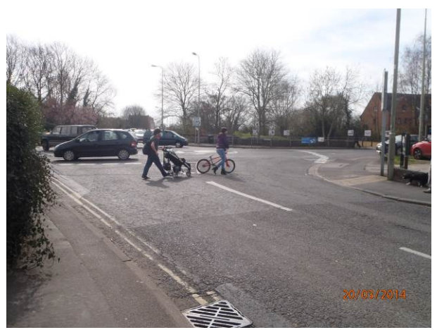
Photograph 1 - Three pedestrians, one of which was pushing a pushchair were observed crossing Spring Road via the existing uncontrolled crossing facility.